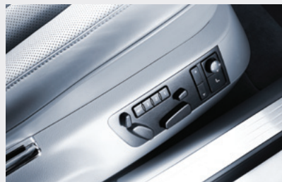
Electric seat adjustment