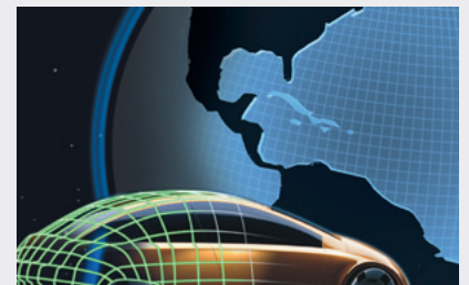
Powerful support for energy components