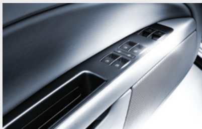
Electric window lifters