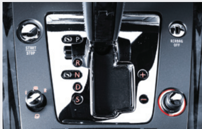
Seat heating and ESP